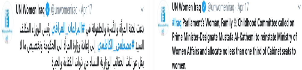
Figure (4): OTW3 and OTTW3

This tweet talks about Woman, Family & Childhood Committee that is concerned with the issue of women, children, and families is one of the most contentious issues in the international community today, especially in Iraq following the changes that have occurred in Iraq since 2003. As a result, a new governmental ministry, the Ministry of State for Women's Affairs, was established to deal with these issues, despite the fact that it was a ministry without a portfolio, the woman, family, and childhood committee was recognized as one of the permanent parliamentary committees (Ali et al., 2018, p.264).