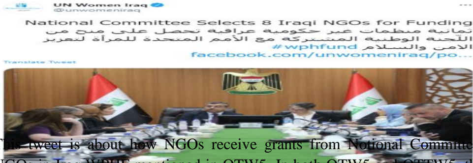
Figure (6): OTW5 and OTTW5

This tweet is about how NGOs receive grants from National Committee. NGOs in Iraq WPHF mentioned in OTW5. In both OTW5 and OTTW5, the usage of naming and description is noticed to be reflecting the ideological way of naming a referent like: