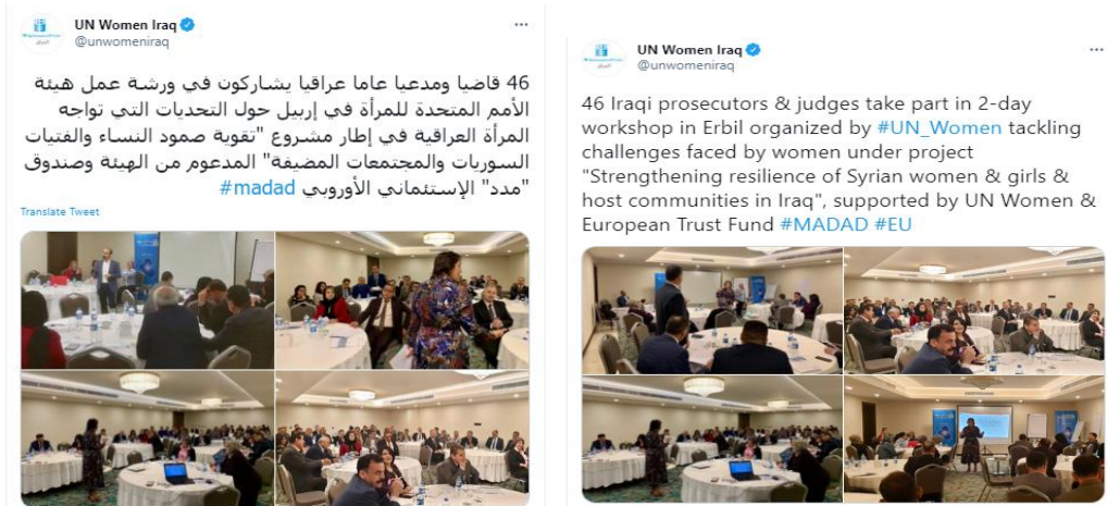
Figure (5): OTW4 and OTTW4